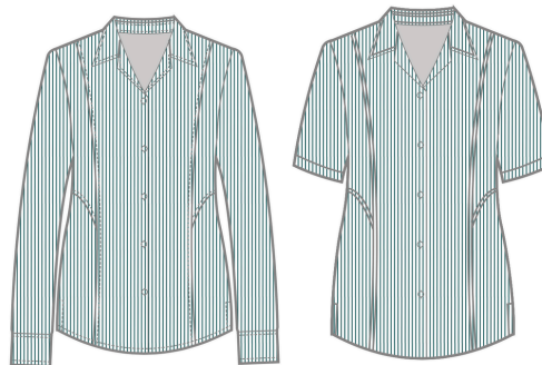
9 Pinstripe long or short sleeve blouse