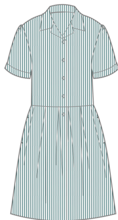
8 Pinstripe summer dress