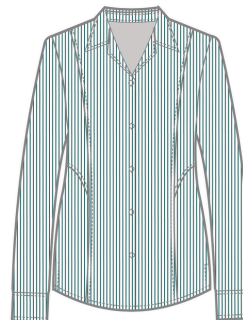
10 Pinstripe long or short sleeve blouse