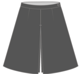
7 Mid-grey Senior Culottes